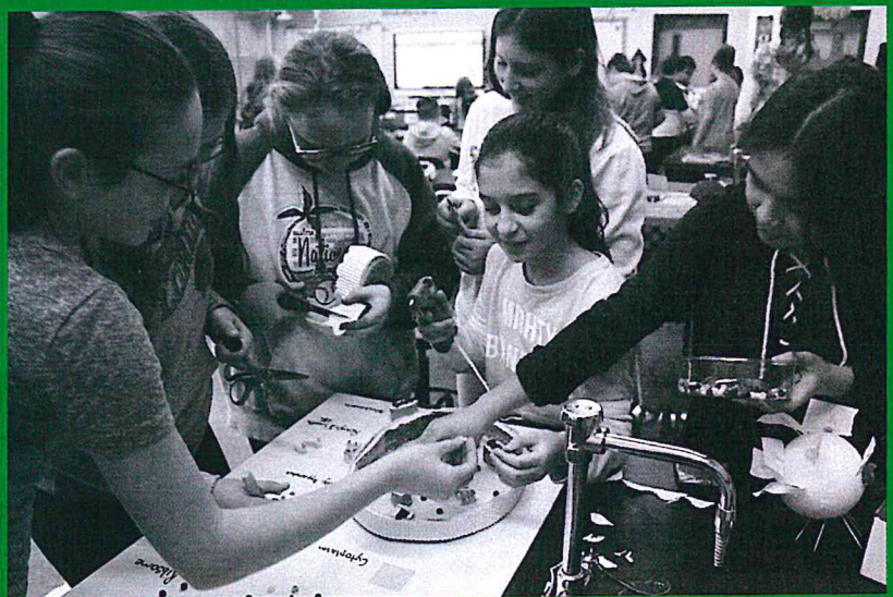
Above: Hudson Falls middle-schoolers work together to design a life-sized cell.

At Hudson Falls, we believe our role is to inspire students to actively discover and persevere. We work to build a curriculum that is forward-thinking with STEAM (Science, Technology, Engineering, Arts and Mathematics) integrated into everyday learning.